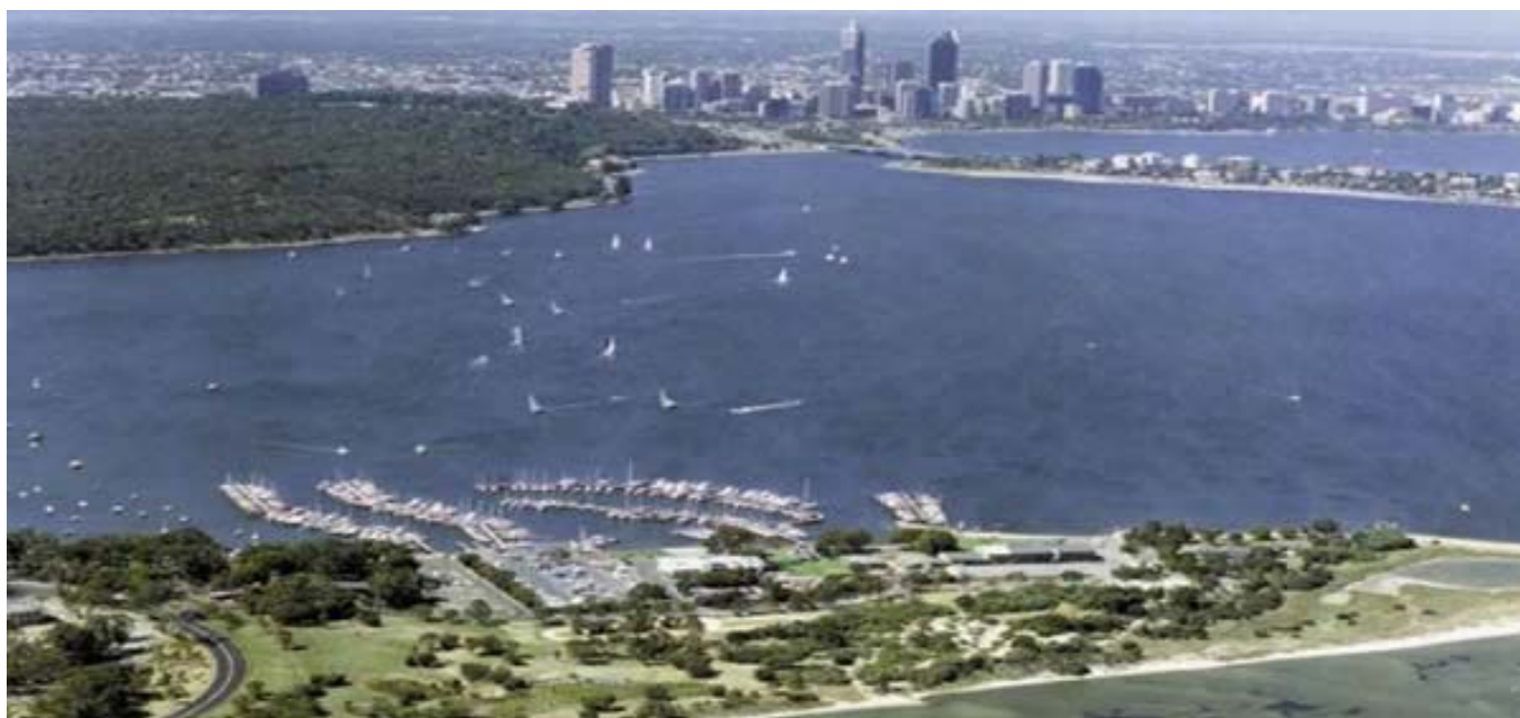
Aerial photograph of Perth, the Swan River and Royal Perth Yacht Club in foreground