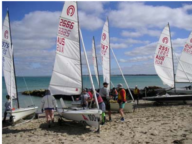
On the beach at RB, November 2005

The Tasar fleet in Adelaide is based at Somerton. Energy in the class has been high since Darwin where we had 12 boats sailing. We would be interested in finding out if that number of boats was exceeded by any other visiting club at the Darwin Worlds.