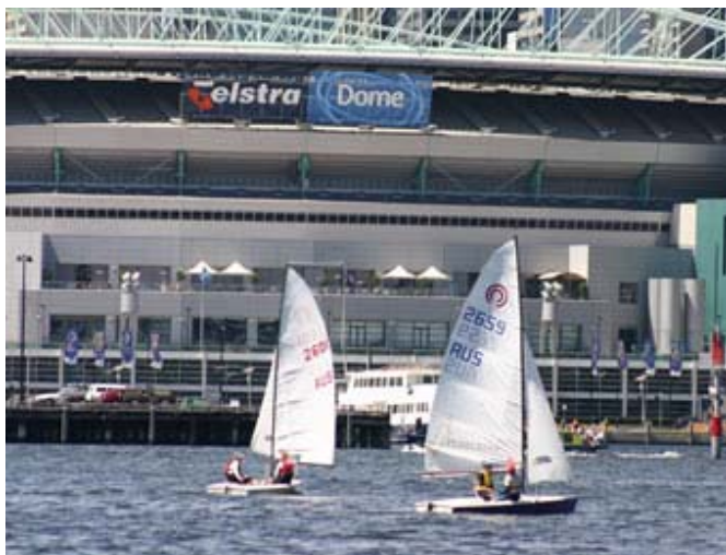
A different sort of sailing backdrop

On the water there were enormous swings and shifts both in the wind and in the place getters - there were 4 individual heat winners, and a lot of individual last