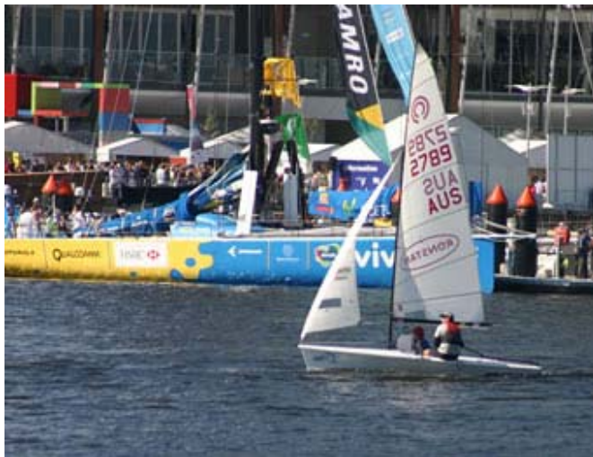
SheepStations and Brasil 1 who wouldn't come out and play

Eleven intrepid Tasars jumped at the opportunity to be part of the Volvo Melbourne Stopover festival at the third annual Docklands regatta, and numerous other