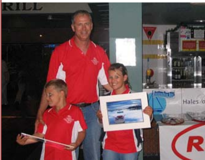
Team Tallis collecting their trophies

Remember it's a holiday. If you've never been to WA before, give yourself at least enough time to do the