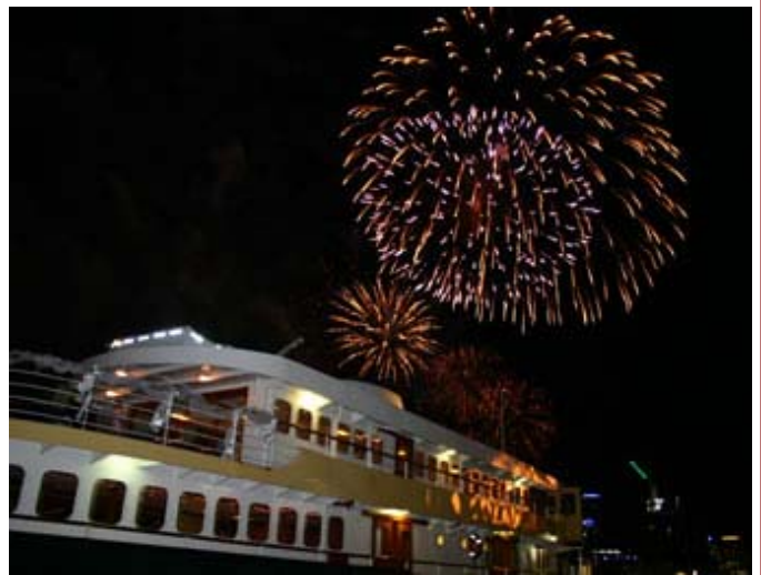
Saturday night fireworks over Docklands