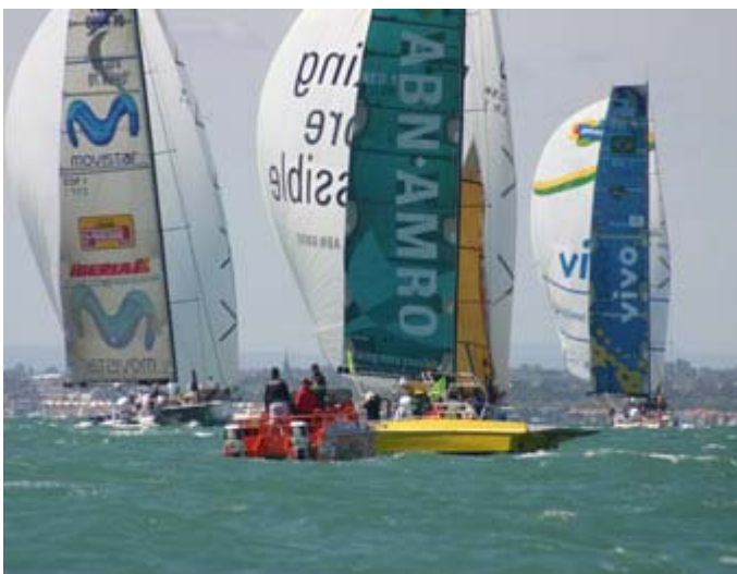
From Melbourne InPort race-- bloody spectator boats!