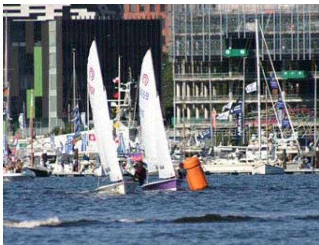
Wotchamacallit and Hakuna Makata dicing with the boat show activity in the background