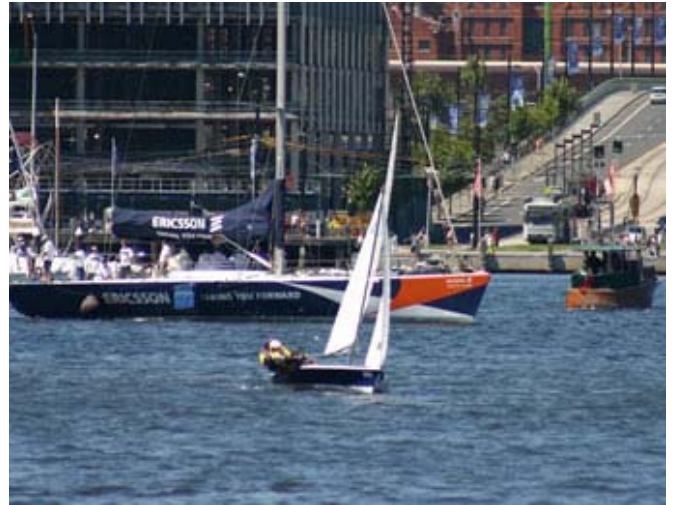
Two Dry Martinis out in front of Ericsson