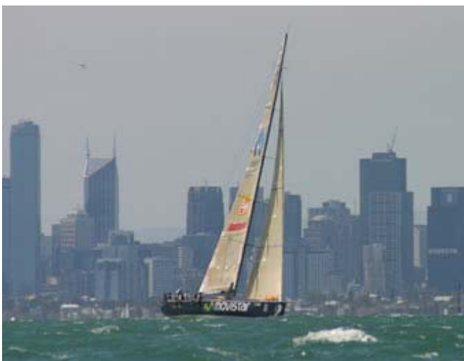
movistar in Melbourne