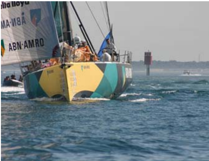
This keelboat came through the race course one recent Saturday at McCrae. Tried calling "starboard" but they didn't take much notice!