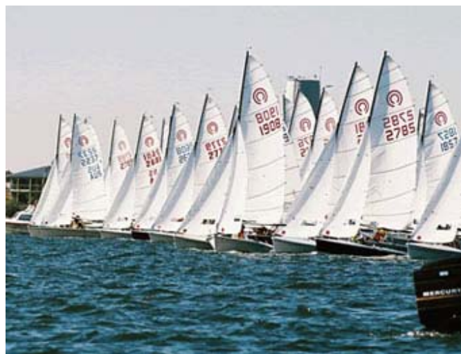
Don't forget the Vic State Titles are on 11-13 March at Yarrowonga YC