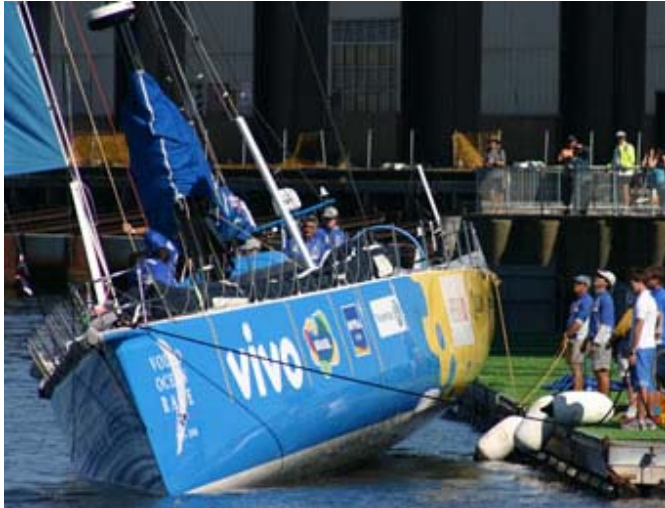
Brasil 1 doing the Bolte Bridge shuffle

Sunday morning saw most of the sleepy-eyed Tasar fleet back at the docks for a breakfast BBQ while watching the Volvos head out to start the next leg of their race. The manoeuvring to get a boat with a 31m mast under a bridge with a clearance of 29 metres made it well worth the early start.