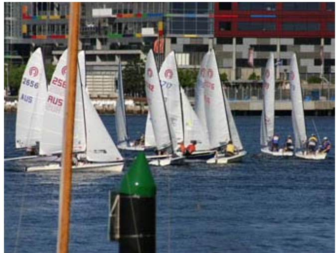
Tight racing would be an understatement