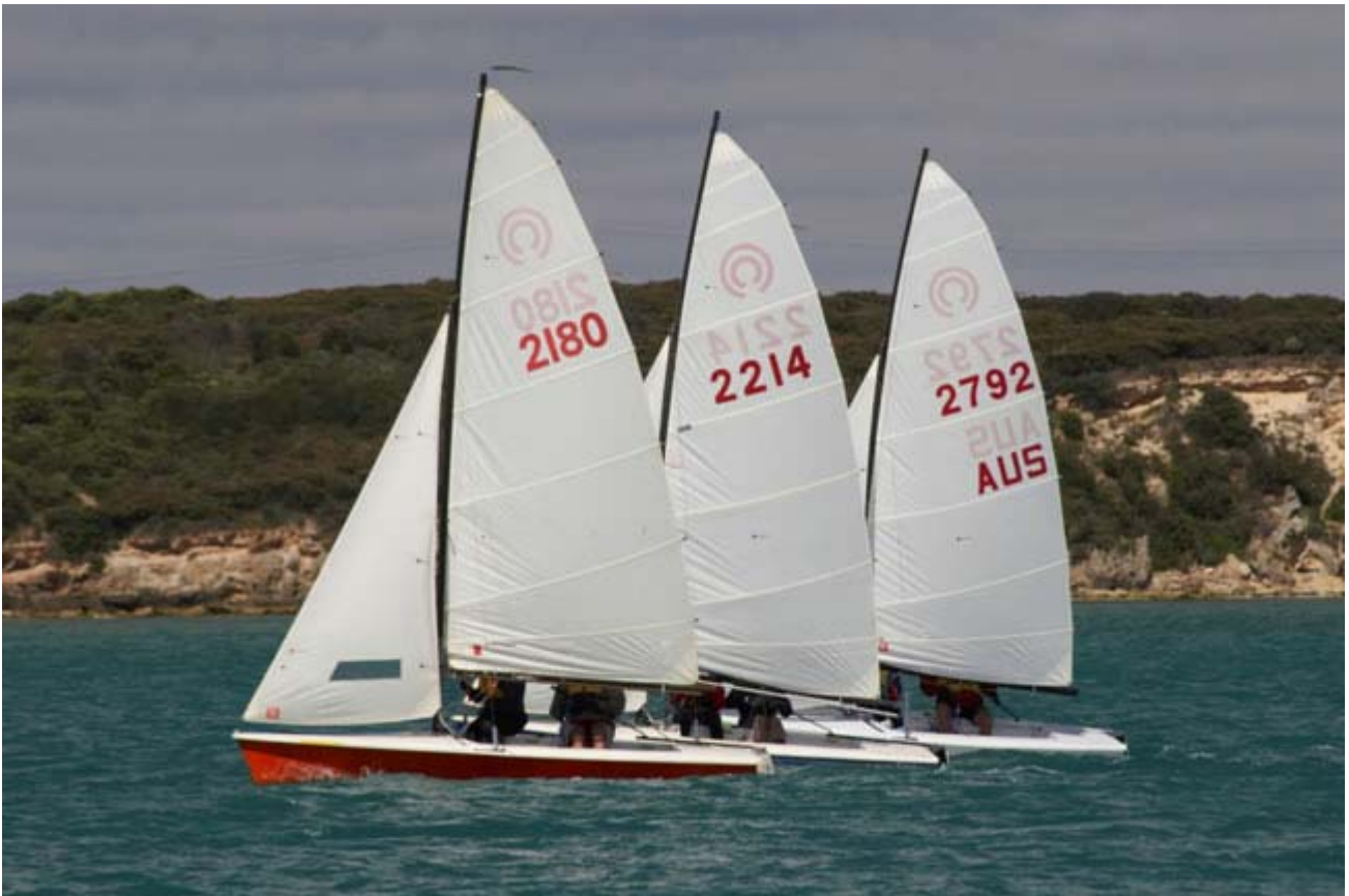
Cover Shot: Perfect Tasar Symmetry at the SA / Vic Challenge, Rivoli Bay SC November 2005

Newsletter of the Australian Tasar Council Inc