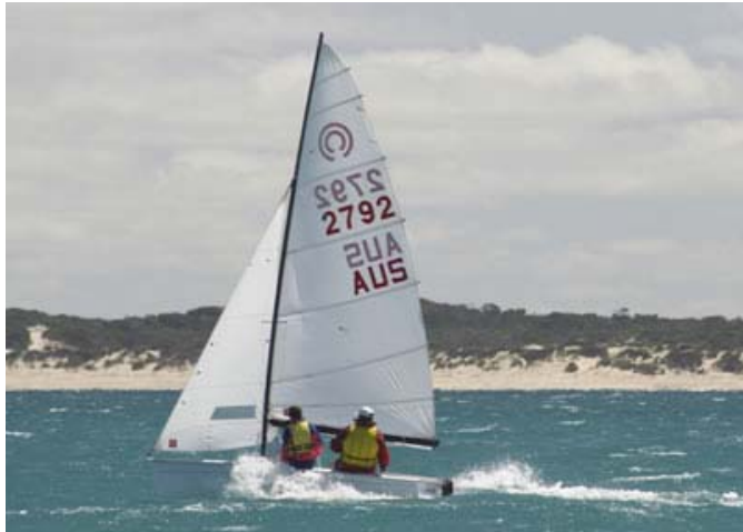
Touchy Feely enjoying a romp on Rivoli Bay