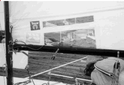
Port side view of window. The upper window is not to be included.

Regions are asked to report back to the World Council by August 31, 2002.