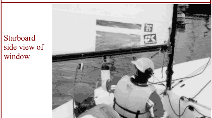
Starboard side view of window