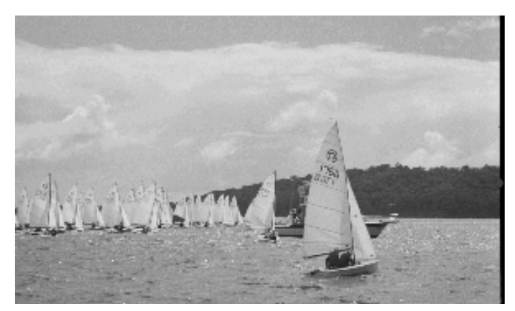
Start of Racing Day 3 Tasar Nationals 2000