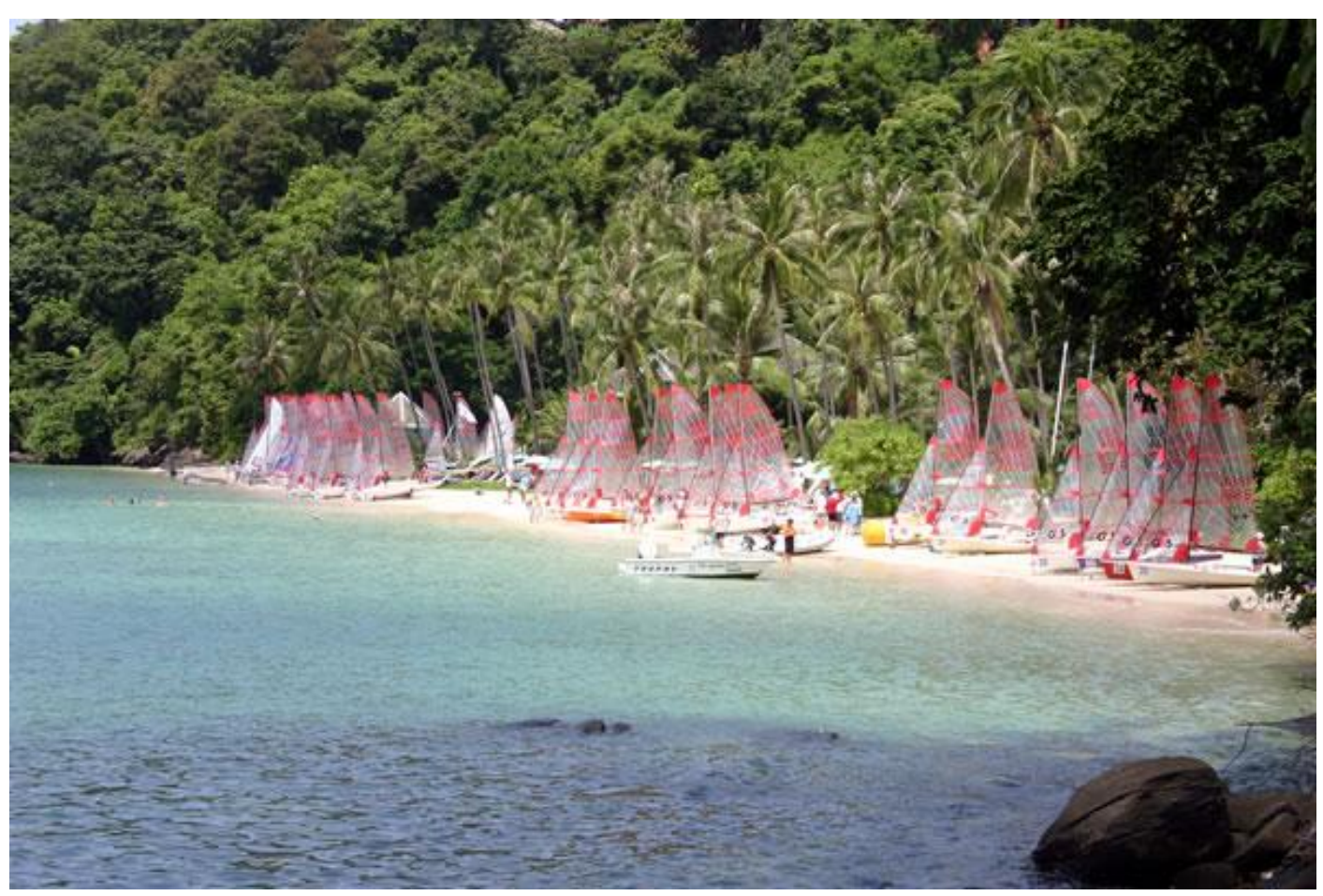
Tasars on the beach in Phuket - Tasar World Championship 2-11 July 2007

Newsletter of the Australian Tasar Council Inc