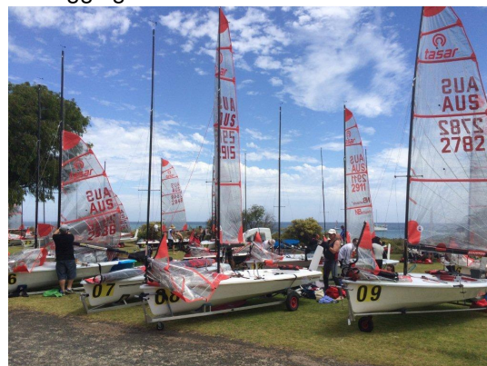
Photo - Rigging time at the Worlds in Busselton.

Since all the championships are now over (and the bodies recovered) normal weekend Saturday sailing has returned to the Mandurah Dinghy fleet with fresh southerly breezes in the pristine Comet Bay. Suddenly there is a strong interest from Laser sailors, grown up Opi sailors, young and old wanting to try out a Tassar so 'watch this space'. We are looking forward to joining fellow Tasars at the Walpole in the Trees Regatta in a few weeks time. So keep 'Zailing' along!